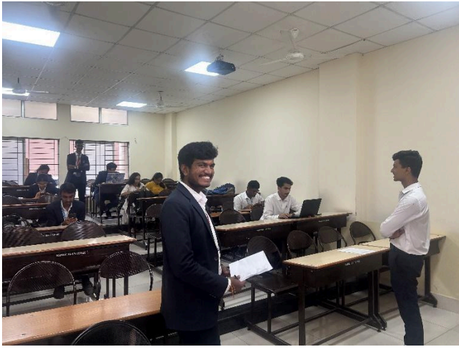
DIGITAL POSTER MAKING