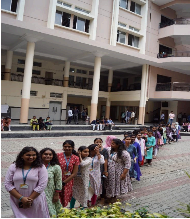
Health Check-up participants