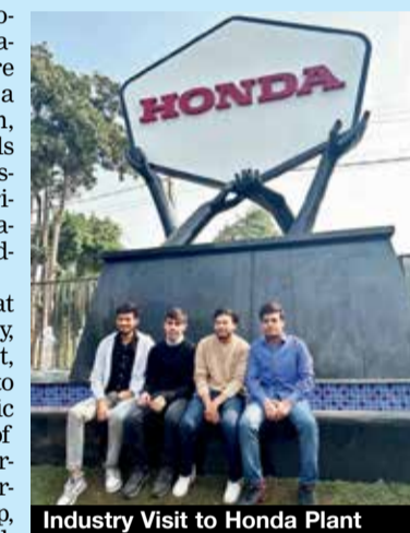
Industry Visit to Honda Plant

Applied Sciences. Community service is a subject in which students visit non-government organizations and contribute back to society, thus aligning with SDG goals.