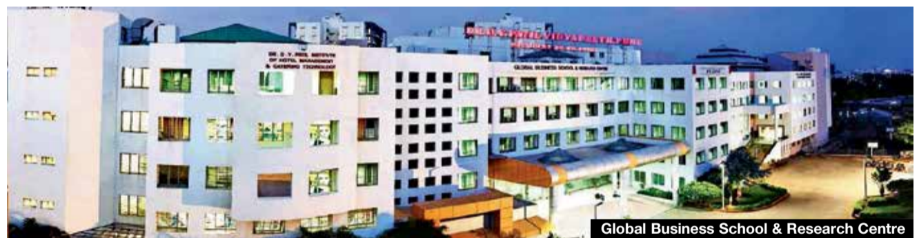
Global Business School & Research Centre